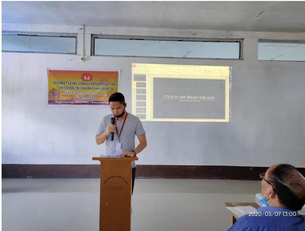
Vice Chairman, Nest presenting the Covid 19 Prevention and Mitigation Protocol, Churachandpur (CMPC) at District Level Consultation District Level Consultation Meeting on Covid 19, Churachandpur at GNM Training Hall.