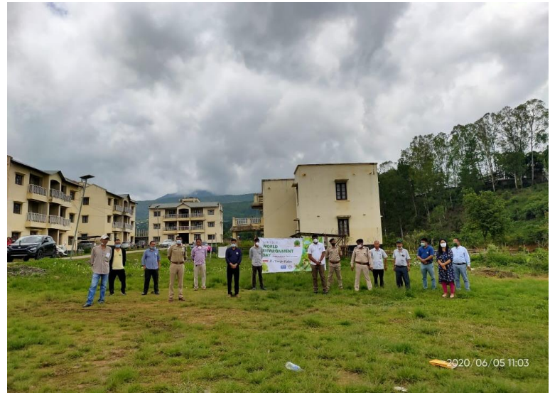
Observation of World Environment Day at Mini Secretariat