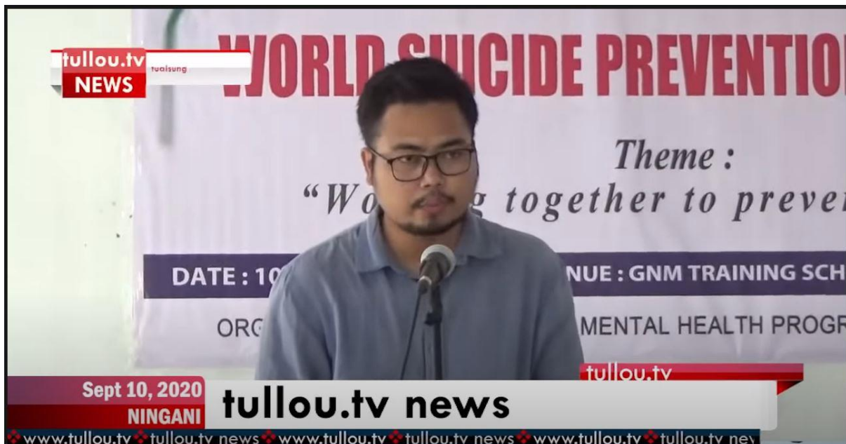
Secretary, Nest presenting updated report of Lamka Suicide Survey 2020 at observance of World Suicide Prevention Day 2020 at GNM Training Hall on 10 th September 2020.