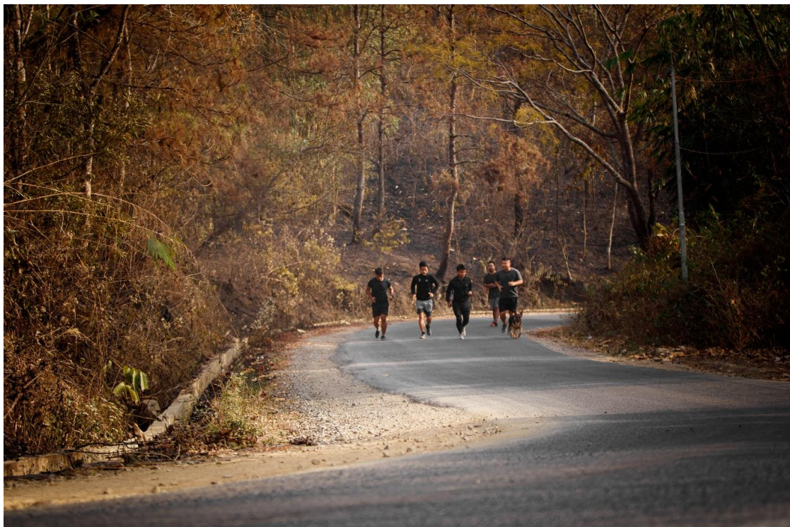
Running Club in Action!