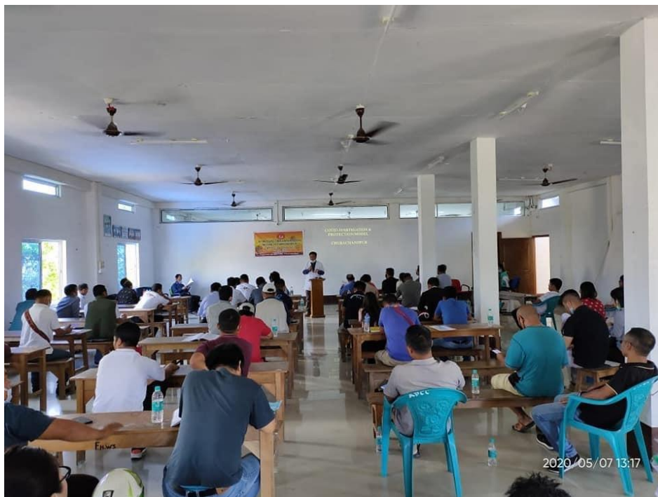
CMO Churachandpur at District Level Consultation District Level Consultation Meeting on Covid 19, Churachandpur at GNM Training Hall